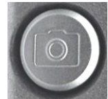
IMAGE BUTTON (3)