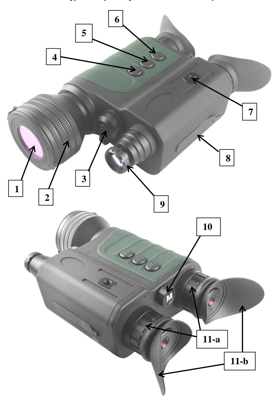
Please identify all the parts of the device PRIOR to operation!